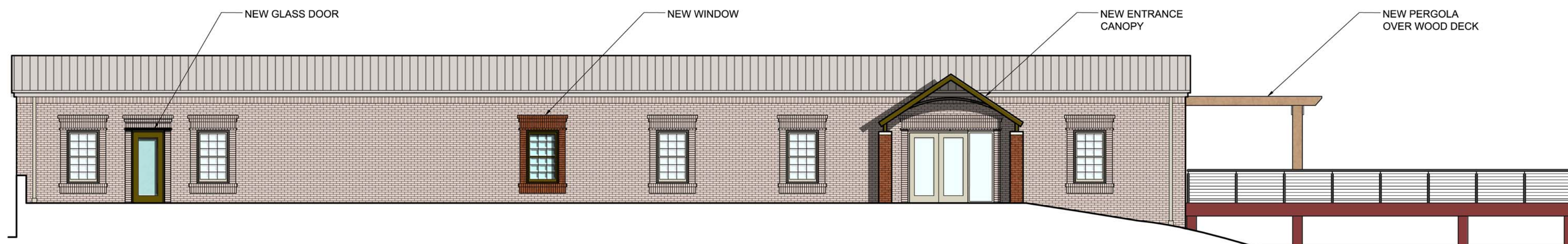
SOUTH ELEVATION SCALE: 1/8" = 1'-0"